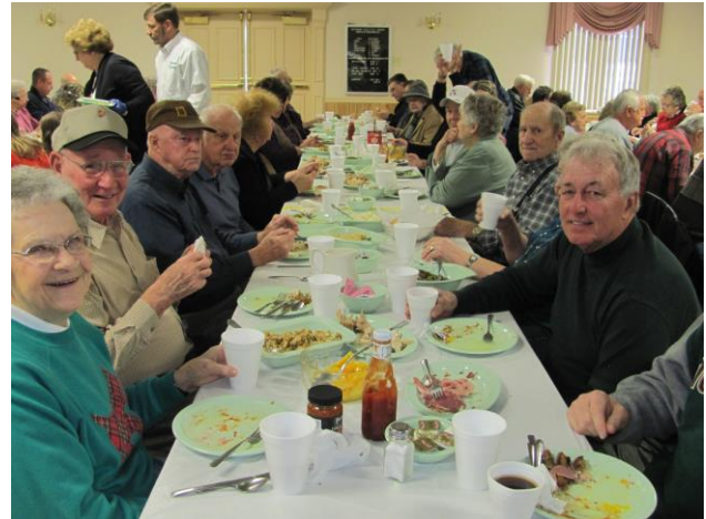
Table of content customers at the annual Public Supper.

PROGRAM Annual visit by the front office of the Frederick Keys