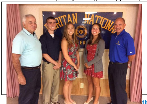
the July meeting.